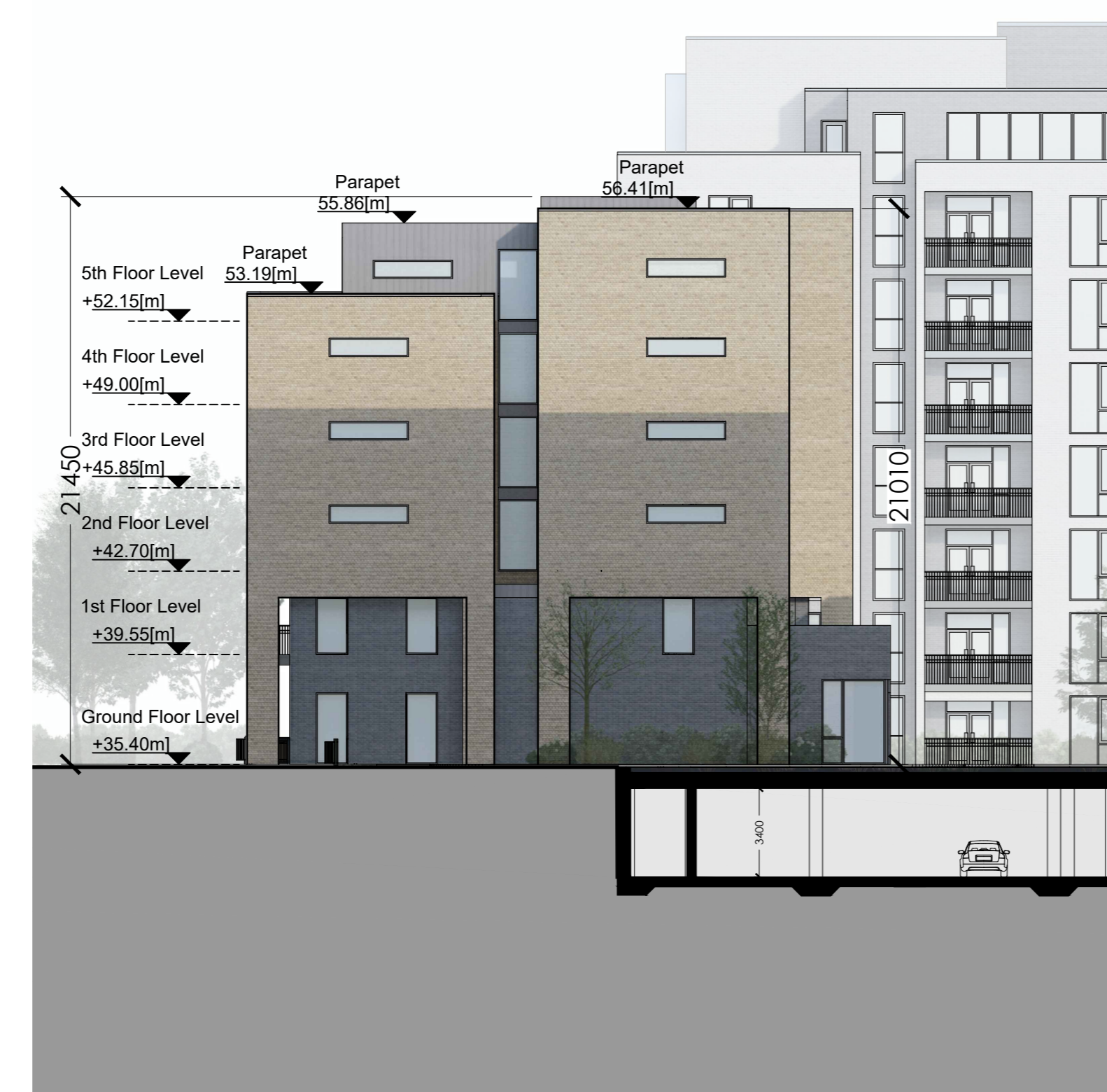
04 - Side Elevation - Block 4 Scale 1:200 @A0