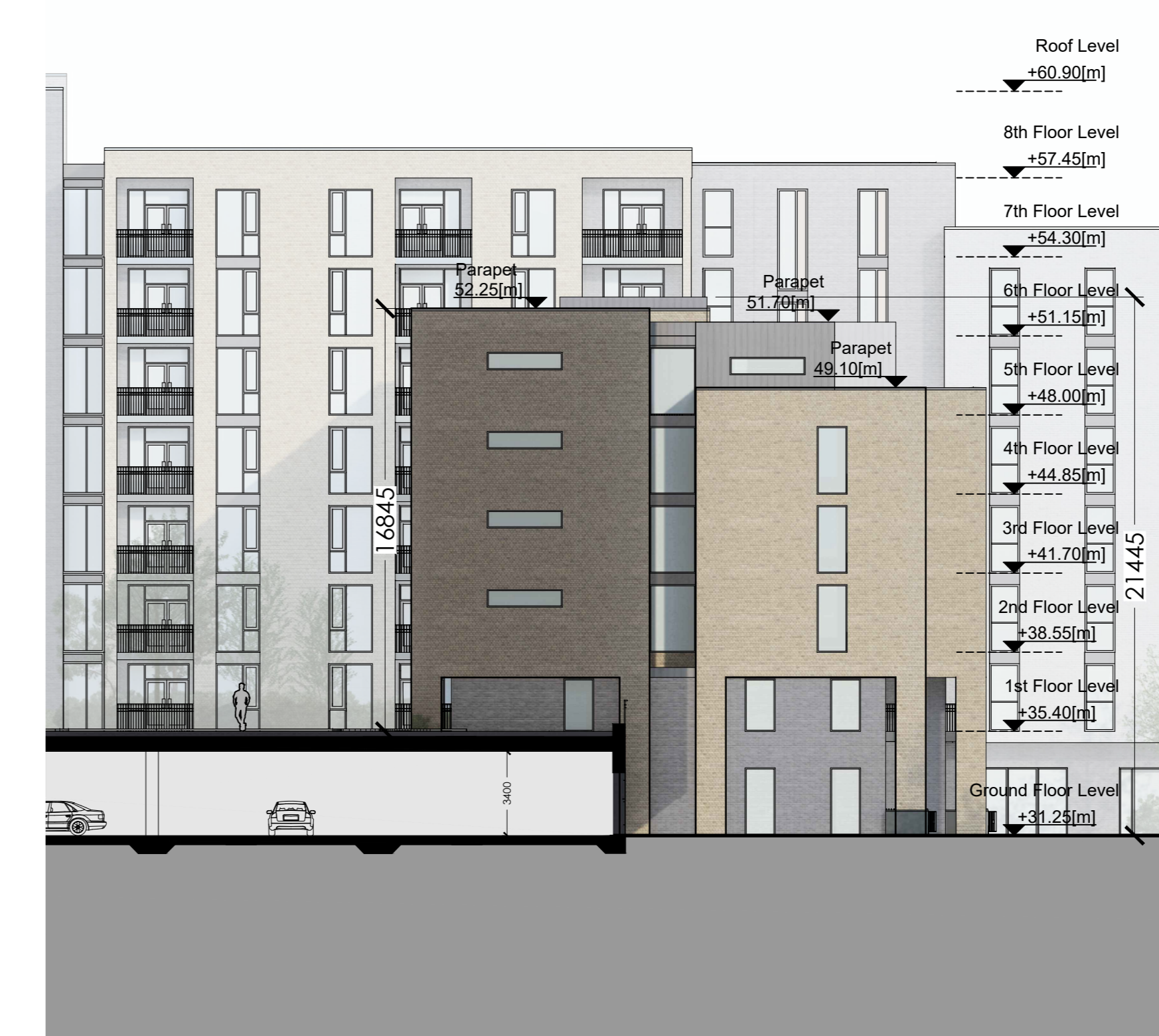
06 - Side Elevation - Block 4 Scale 1:200 @A0