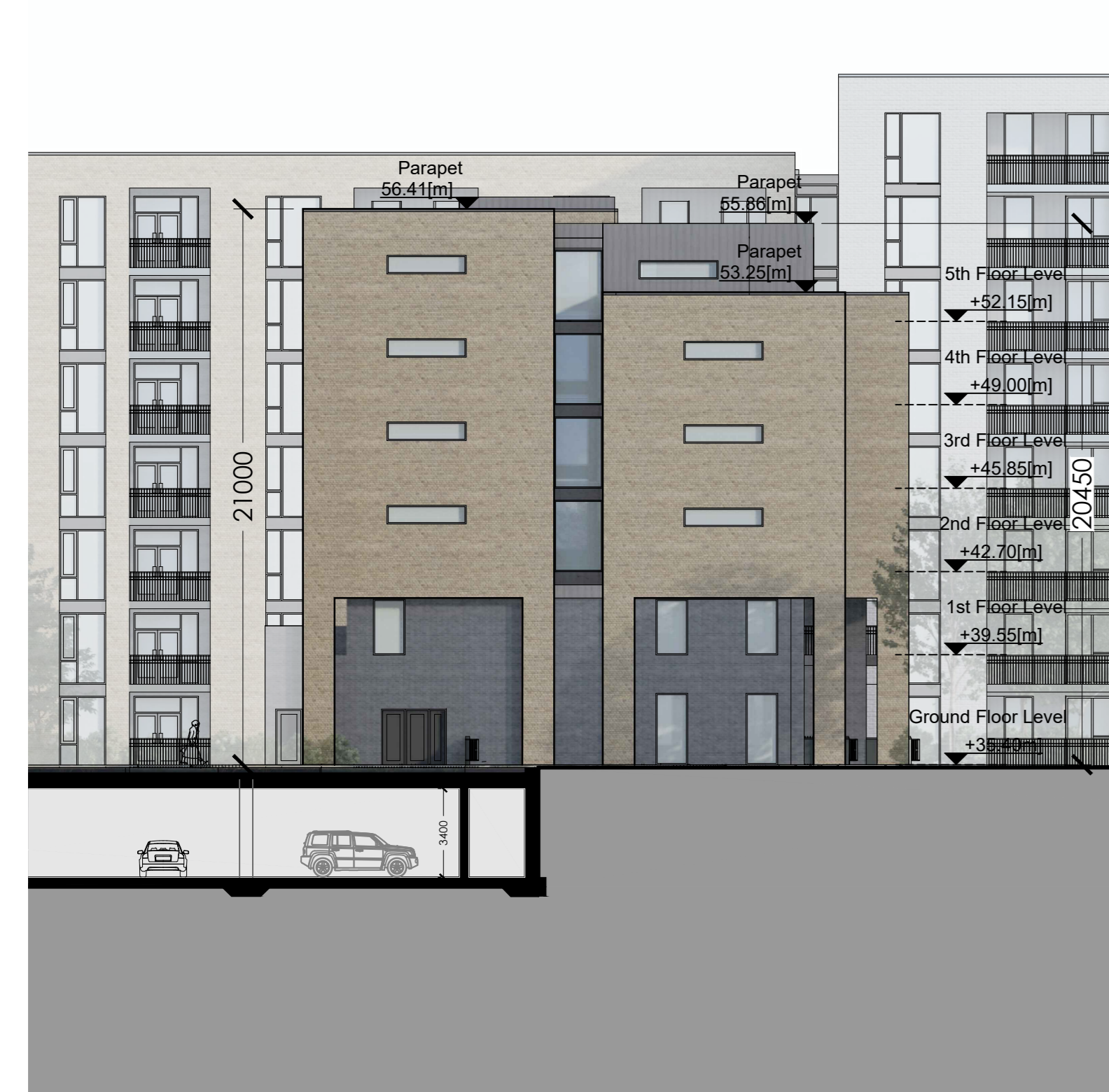
03 - Side Elevation - Block 4 Scale 1:200 @A0