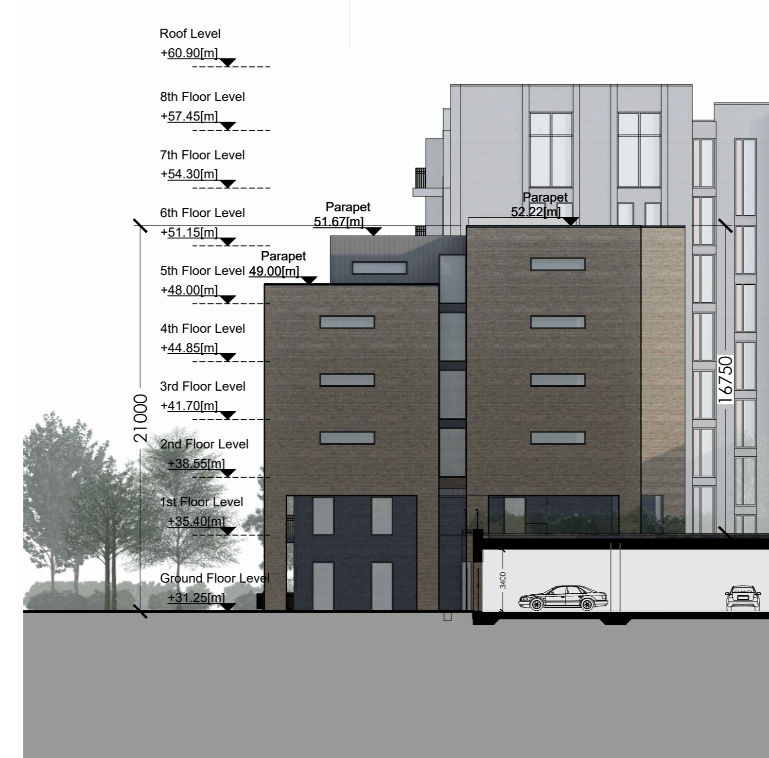
05 - Side Elevation - Block 4 Scale 1:200 @A0