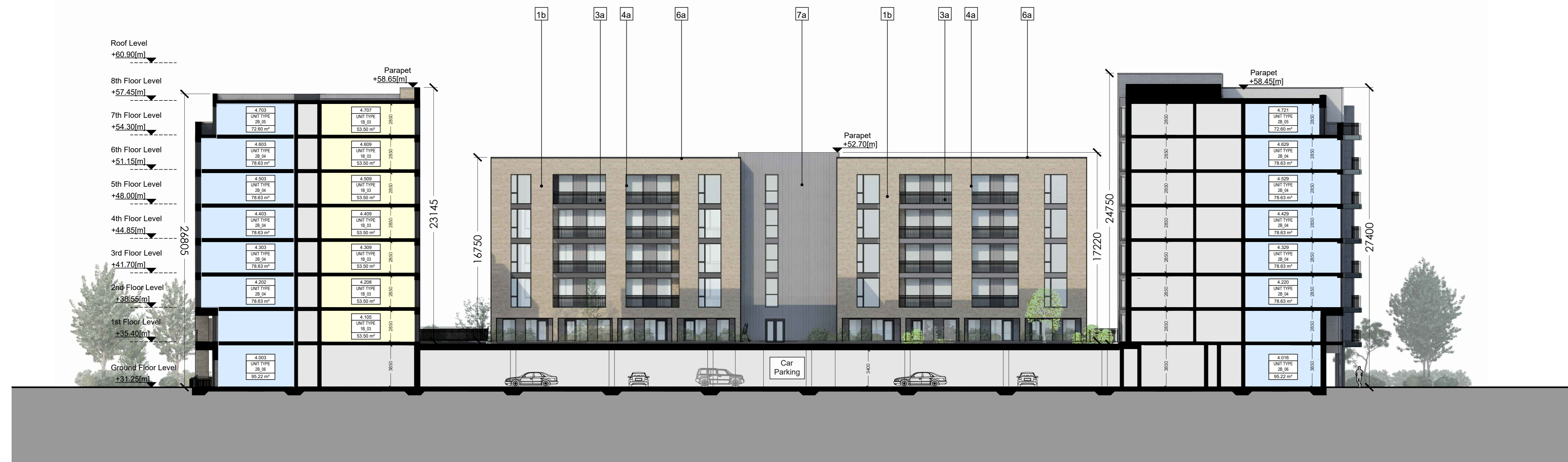
02 - South Courtyard Elevation - Block 4 Scale 1:200 @A0

Note: 1.8mm high glass balustrade can be provided on the upper level balconies if required by the Planning Authority.