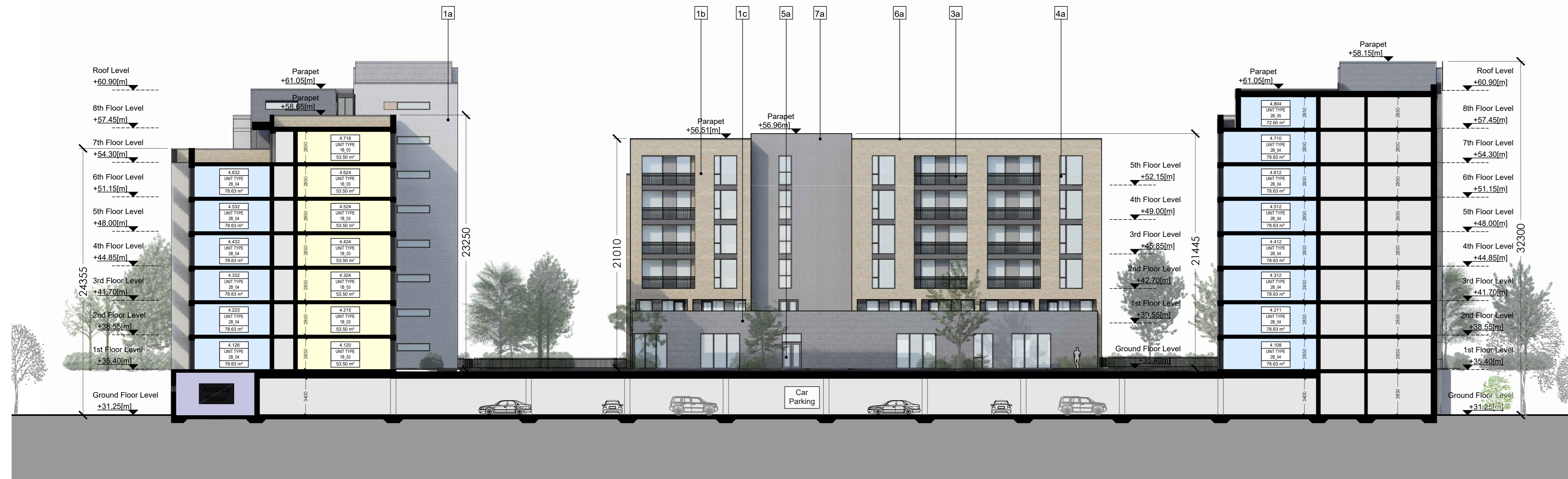
01 - North Courtyard Elevation - Block 4 Scale 1:200 @A0